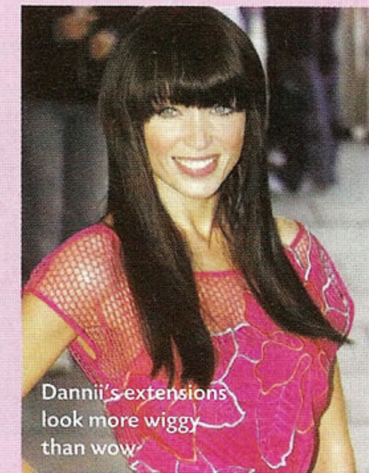
Dannii's extensions look more wiggly than wow