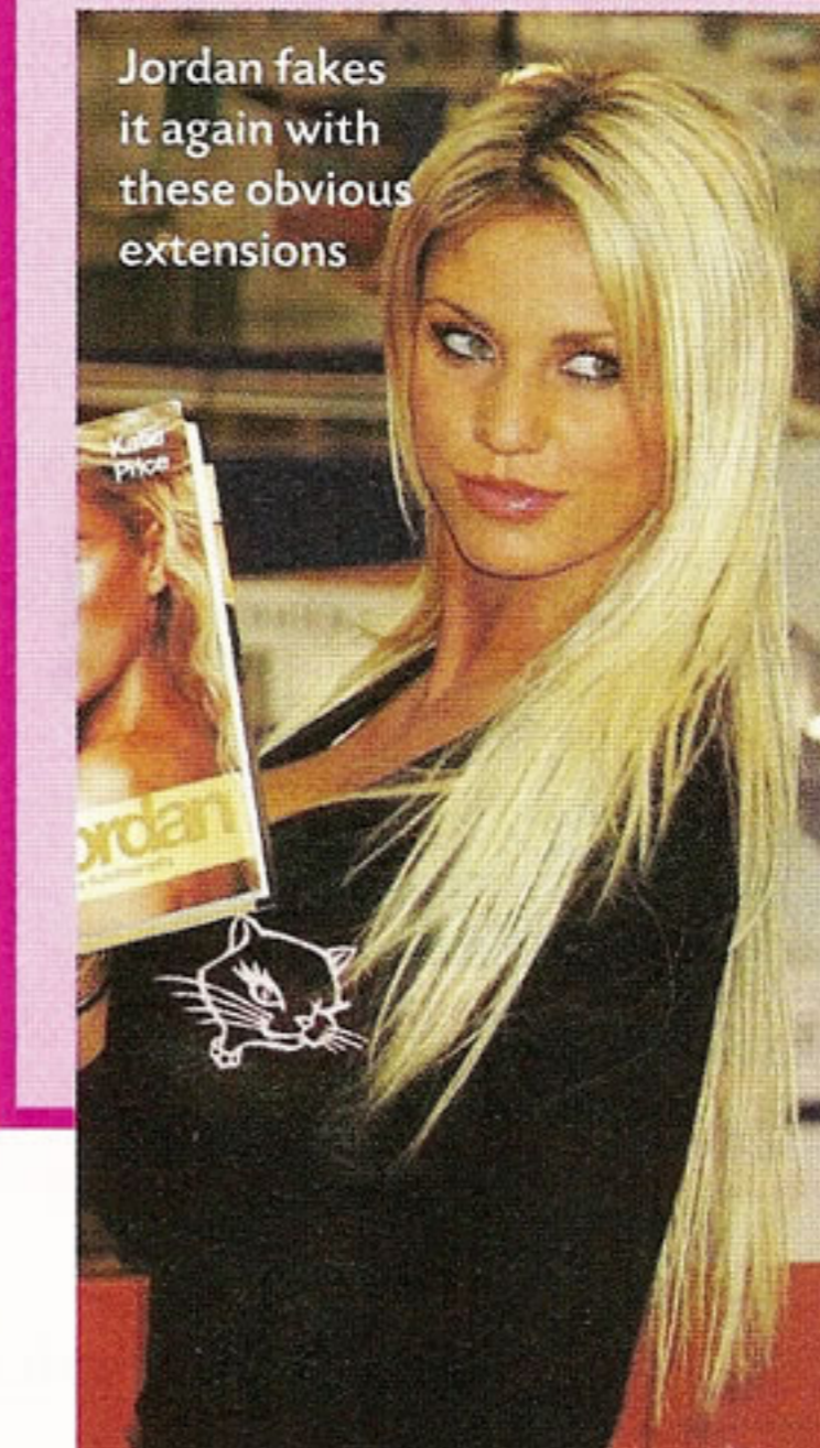
Jordan fakes it again with these obvious extensions

They may have access to top stylists, but sometimes even celebrities get it wrong