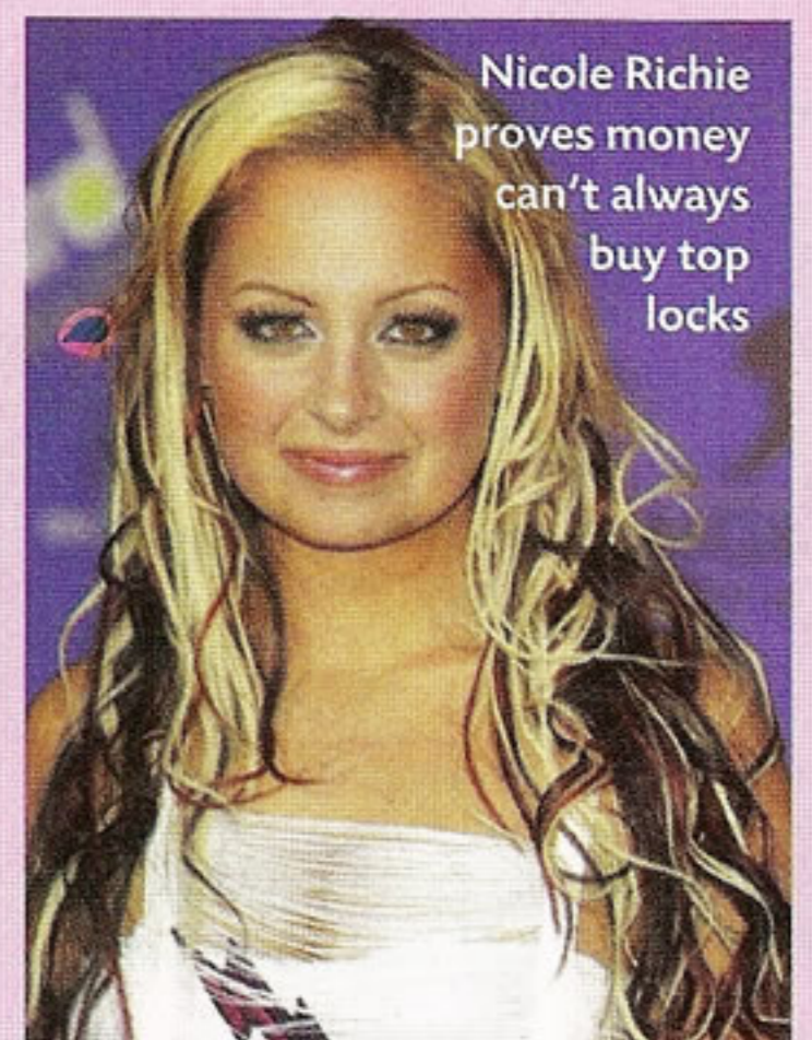
Nicole Richie proves money can't always buy top locks