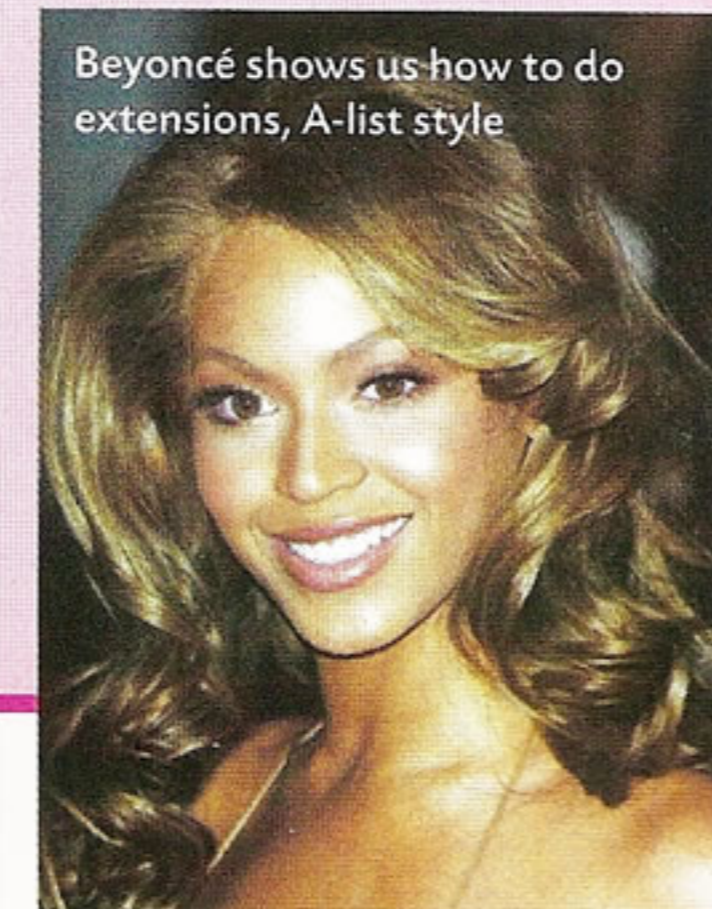
Beyoncé shows us how to do extensions, A-list style