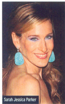
Sarah Jessica Parker